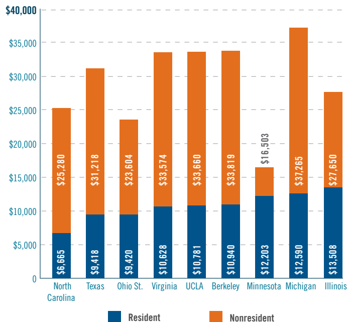
Undergraduate tuition and fees, 2010-11

State appropriations have dropped from 47 percent of UT's budget to 14 percent